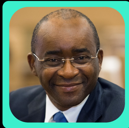
Strive Masiyiwa (Virtual) Founder & Executive Chairman, Econet Group